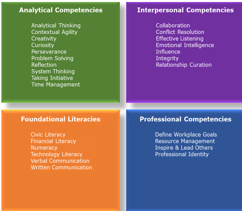
Figure-2: Four Cluster EC Model

including analytical competencies, interpersonal competencies, foundational literacies, and professional competencies (Figure-2 and Appendix-2). The second level is composed of DSCs that will be specific to a role or organization.